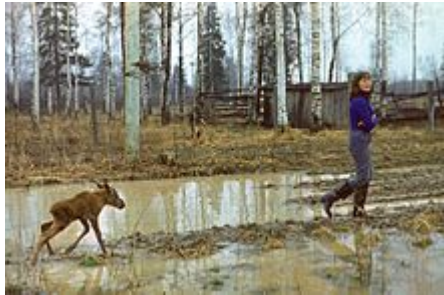
Imprinting in a moose .

Imprinting enables the young to discriminate the members of their own species, vital for reproductive success. This important type of learning only takes place in a very limited period of time. Konrad Lorenz observed that the young of birds such as geese and chickens followed their mothers spontaneously from almost the first day after they were hatched, and he discovered that this response could be imitated by an arbitrary stimulus if the eggs were incubated artificially and the stimulus were presented during a critical period that continued for a few days after hatching. [24]