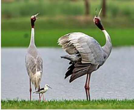
Courtship display of a sarus crane

Individual reproduction is the most important phase in the proliferation of individuals or genes within a species: for this reason, there exist complex mating rituals , which can be very complex even if they are often regarded as fixed action patterns. The stickleback 's complex mating ritual, studied by Tinbergen, is regarded as a notable example. [36]